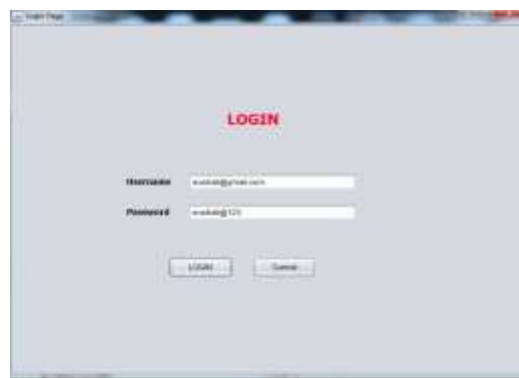
Fig 1.2 Login

Once the registration is done the user can login to the system. This module will ask the user to provide the username and password. This will be accepted and user will be told to validate whether the details are entered correctly or not. Once the entry is done correctly database will be checked for entry. If the user is authorized it will be directed to homepage.